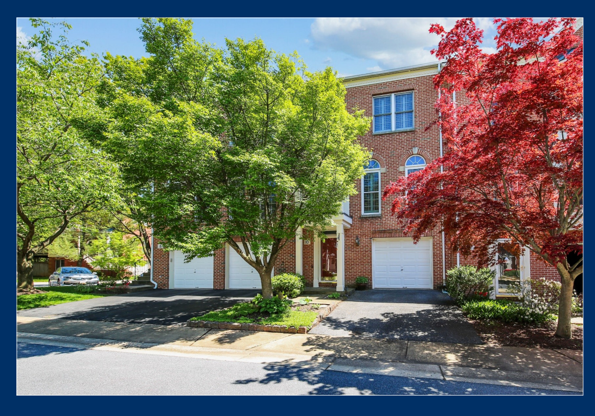
10 Fire Princess Court | Rockville, MD 20850